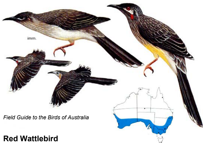
Field Guide to the Birds of Australia