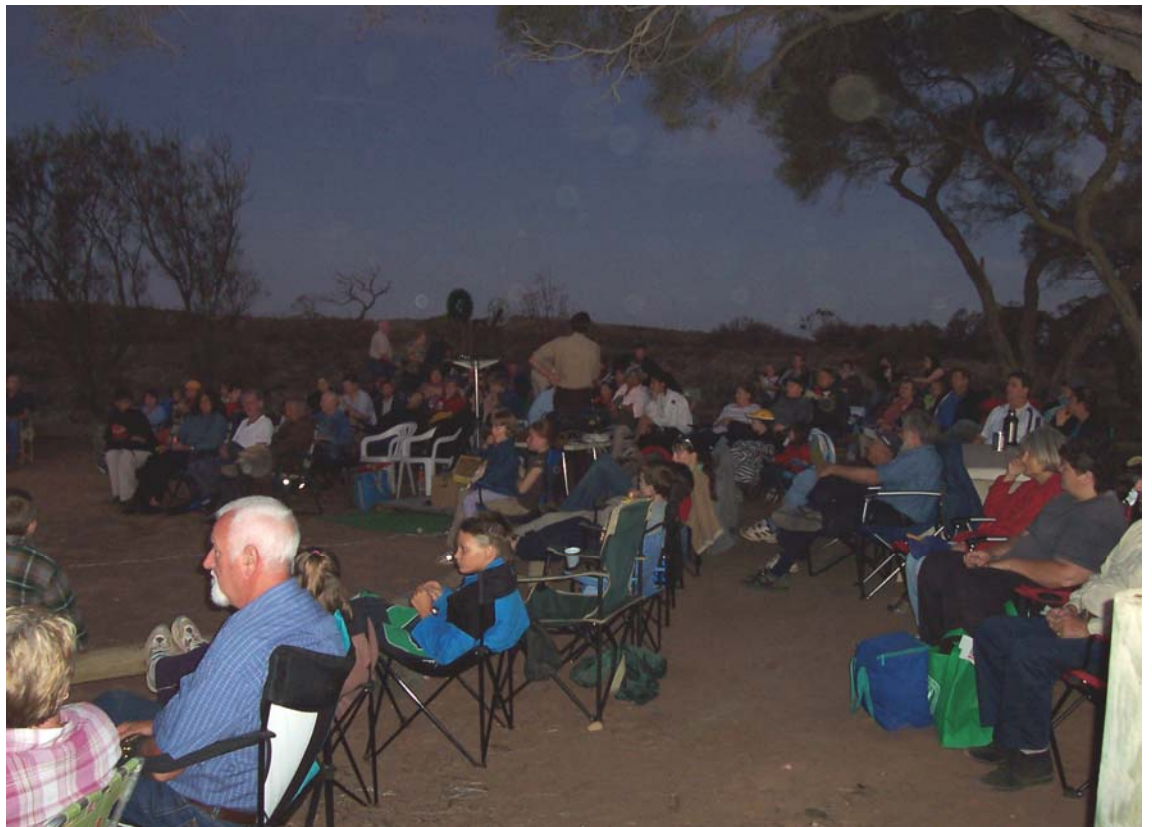
Part of the tremendous turnout at the recent Film Night in the Park on Saturday February 26th. Over 100 people turned out for what was an extremely pleasant evening.