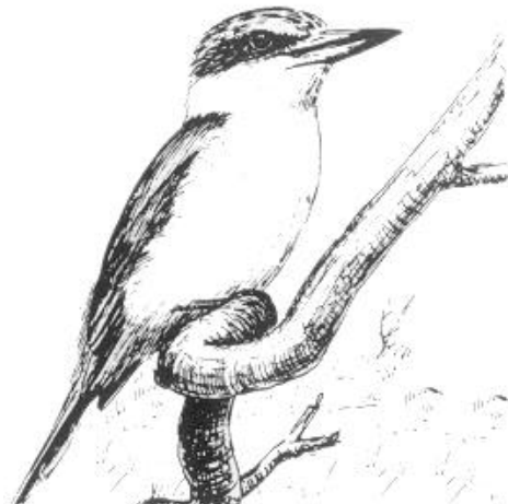
Red Backed Kingfisher